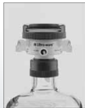
ULTRA-WARE® HPLC Five Valve Cap Systems

Recommended for most solvents used for HPLC mobile phase. Not recommended for tetrahydrofuran (THF), chlorinated hydrocarbons, ethers or ketones.