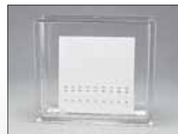
Kimble Chase TLC Tank