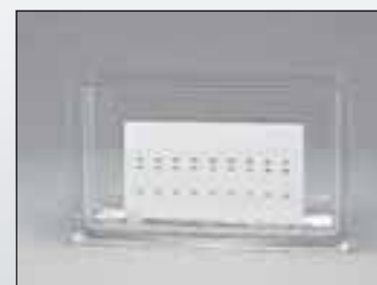
Kimble Chase TLC Tank "Shorty"