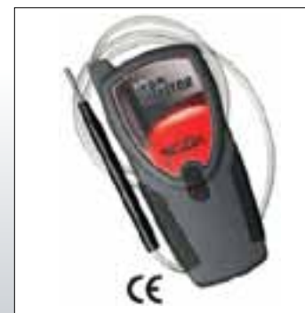
Restek Leak Detector

PDF Discover more: Download the Leak Detector flyer on: www.lomb.com.au/LeakDetector