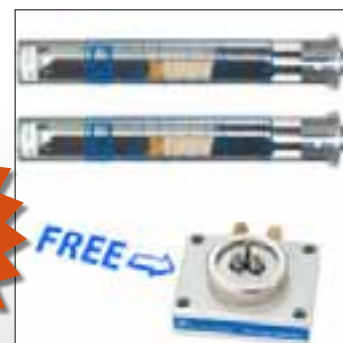
SGT Triple Gas Filter Kit