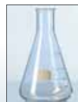
Narrow Neck Erlenmeyer Flask

Items must be purchased in standard pack sizes.