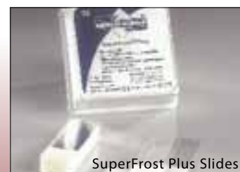
SuperFrost Plus Slides