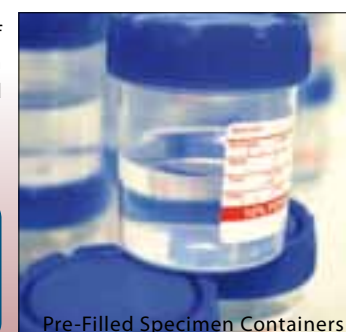
Pre-Filled Specimen Containers

For more information about Pre-filled Specimen Containers, simply visit www.fronine.com.au/prefilled-jars.htm or contact your local Lomb Account Executive or Customer Service representative and they will work with you to deliver a customised solution to suit your needs.