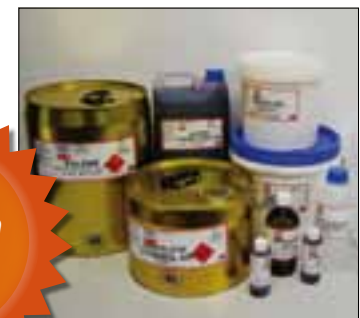
Fronine Stains & Solvents