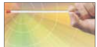
KIMAX NMR Tube

PDF Discover more: www.lomb.com.au/NMR-Tubes