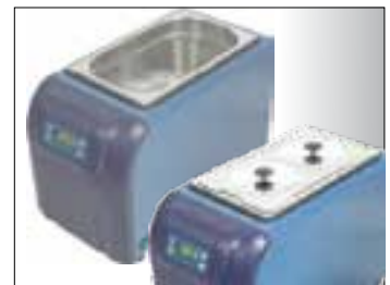
Boeco Water Bath PWB-4