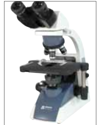
Boeco Binocular Microscope