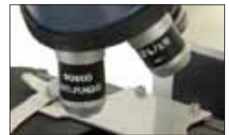
Anti fungus treated objectives