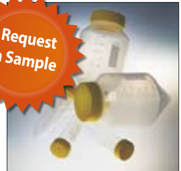
TPP Bioreactor Filter Tube