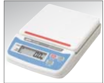
A&D HT-Series Balance