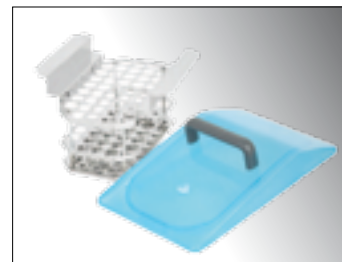
Water Bath Accessories

The feature packed model PWB-4 personal water bath from Boeco is also very light on the wallet.