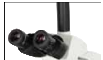
Boeco Trinocular Head