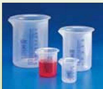
Beakers - with blue graduations