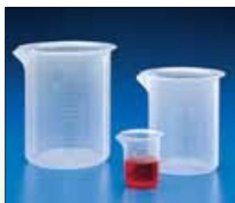
Beakers - PP Moulded